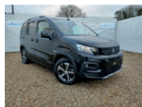
Full Electric EV 2.0 EV now available with full lowered floor or for disabled driver. Choice available