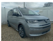
VW Multivan 2023 Hybrid