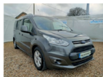
Touneo Connect 2017 Titanium Model Choice available . Lowered floor