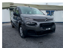
Citroen Berlingo 2023 Now in Stock