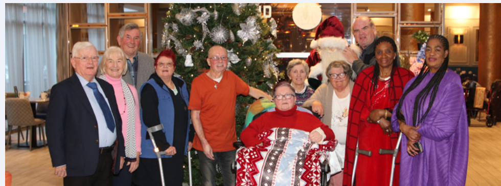
Pictured are members of the Dublin South West Social Support Group at their Christmas lunch in the Clayton Hotel, Dublin.