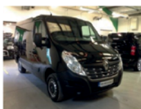
Renault Master Up to 7 Seats Plus Wheelchair Occupant, Ricon Lift, As New Choice of in Stock