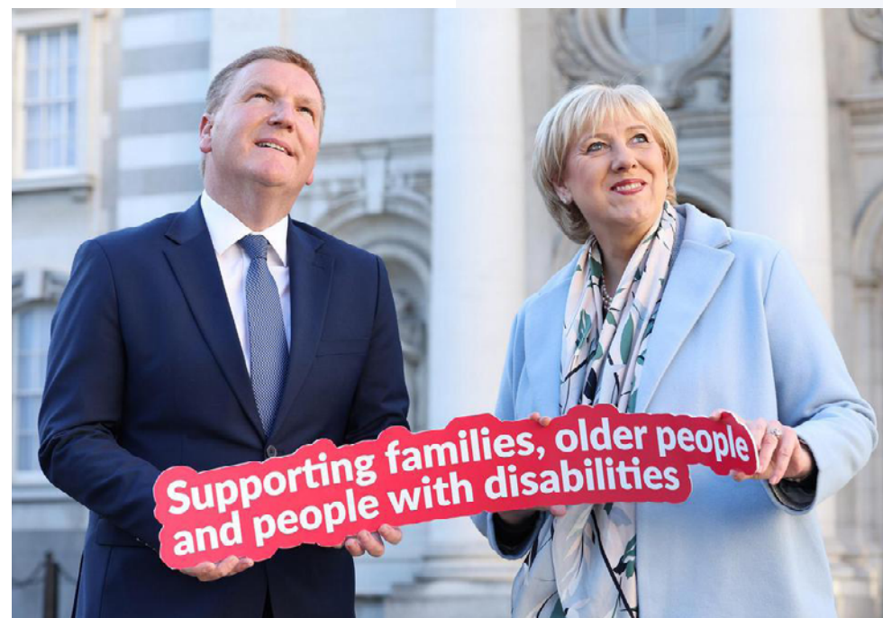
Public Expenditure Minister Michael McGrath and Social Protection Minister Heather Humphrey.

If you get a means-tested payment, you have already satisfied the means test and it does not need to be done again.