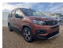
Peugeot Rifter 2023 Now in Stock