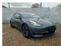
Automatic Cars Choice of cars in stock suitable for drivers or passengers on the scheme