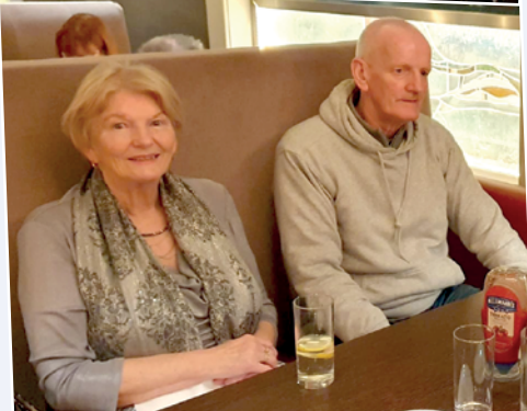
Pictured are members from around the country, enjoying the craic with friends in the Clew Bay Hotel, Westport