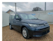
VW Caddy 2023 New model