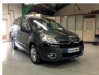
Citroen Berlingo 1.6D, Multispace Plus, 3-4 Seater & Wheelchair Chair Occupant, Choice of 14 in stock