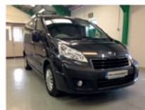
Peugeot Expert Selection in stock Up to 6 Seats Plus Wheelchair Occupant