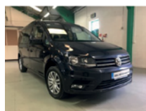
VW Caddy Maxi 2016-2018 Now available with lowered floor & 5 seats. Choice in stock.