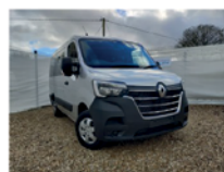
Renault Master New model Up to 8 Seats Plus Wheelchair Occupant, * New & Used*