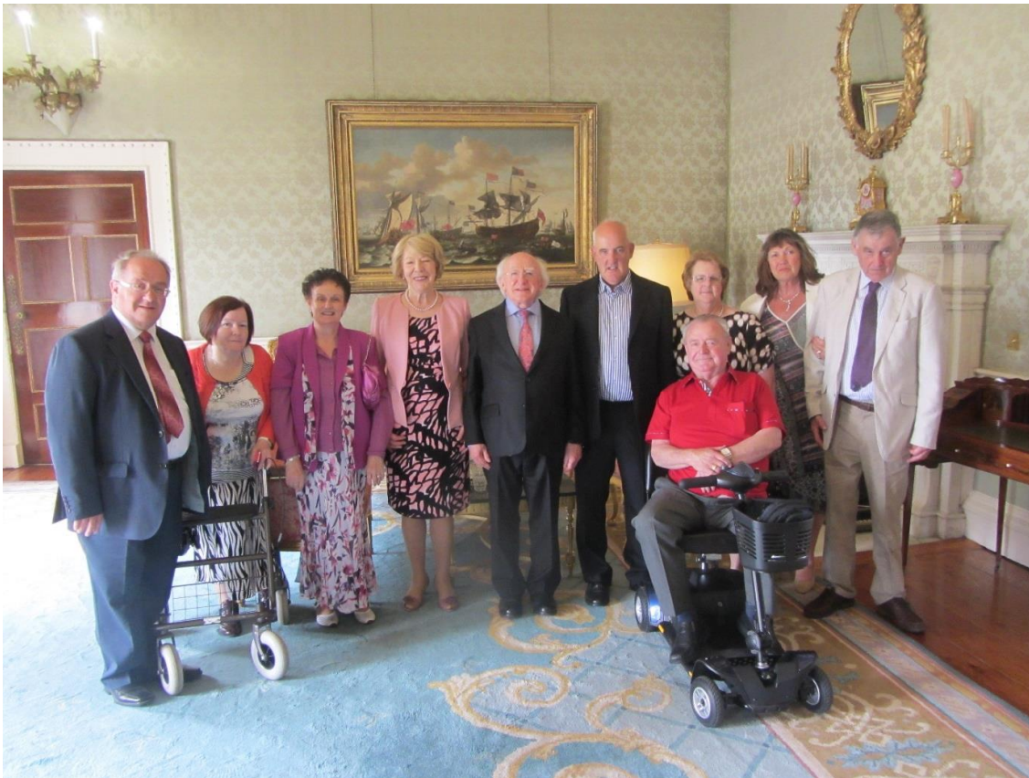
Members of Castleblayney Social Support Group with President Michael D. Higgins

On Wednesday, 2 nd July 2014, eight members of the Castleblayney Social Support Group visited Áras an Uachtarain. On arrival at the Áras, members were treated to a rare glimpse of the President's vehicles and armoured personnel carriers which were on display outside. These were used by former Presidents of Ireland and Irish troops on United Nations peace keeping duties.